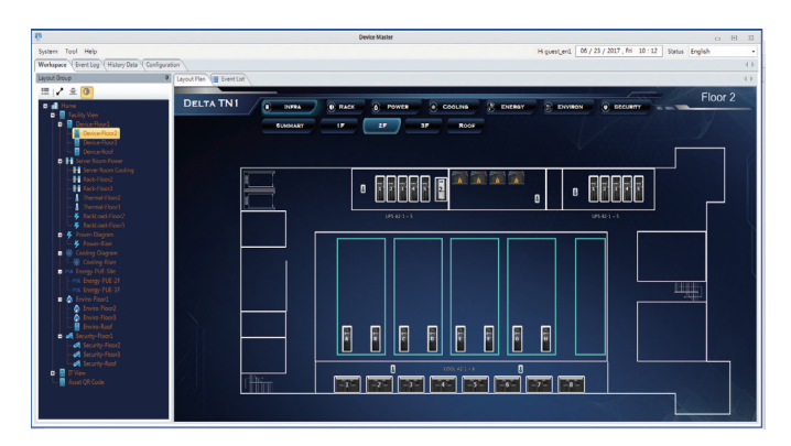
FIGURE 2. Navigational Graphics

InfraSuite Device Master stores all history events and data into its database. Users may use this data for analysis. In addition, the database can be backed up automatically base on user preference.