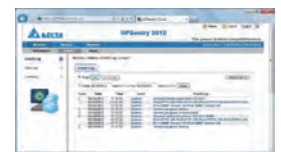
Advanced UPS Management Software - UPSentry