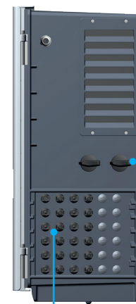
DC Input (H4) DC Switch x 12 strings