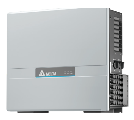
Example: M70A Flex

Special features are integrated into our inverters to increase safety and improve operating behavior.