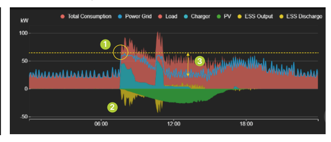
Daily Load Profile With DeltaGrid® EVM