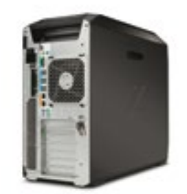
BtO – Server - Hardware