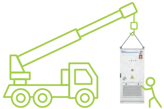
Traditional Crane Installation