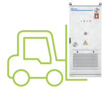
DEL Terra C Forklift Transportation