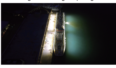
Shantung - Squid lights