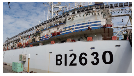
Shantung - Saury lights