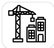
Construction and real estate activities