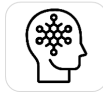
Professional, scientific and technical activities

Next, we will list all the descriptions regulate on REGULATION (EU) 2021/2139, and hand it over to each responsible business group (BG) for further confirmation of whether our products or solutions meet the specific economic activities criteria. Delta has identified 13 taxonomy-eligible economic activities as listed in Table 1.