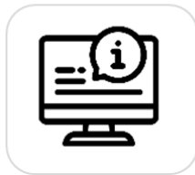
Information and communication